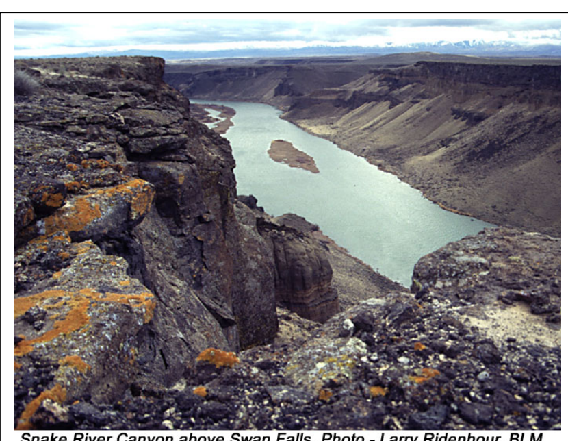
Snake River Canyon above Swan Falls.

climate, geology, soils, and vegetation create an ecosystem for raptors and their small rodent prey,<sup>8</sup> and, the area supported the densest ground squirrel population ever recorded.<sup>9</sup> In addition to the unique population of birds of prey, the area has hundreds of cultural sites, some dating back as far as 12,000 years. 10 Based on the unique population of birds of prey and the valuable cultural sites in the area it has been formally protected since 1971, though the form of this protection has changed over time. 11